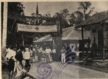
Arch of welcome to the Countess of Linsatt at the Lepet Settlement.