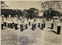
Constabulary Band at the Passing Out Parade.