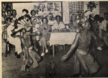
Dayak inmates of the Lepet Settlement dancing before the Countess of Linsatt.