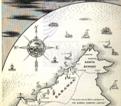
"The icons indicate Offices and Branches of THE BORNEO COMPANY LIMITED"