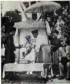
The Duke receives a Malay welcome in Kuching