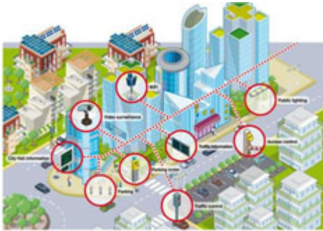
Figure 1: An illustration of a typical smart city

Technology gives you a head start in dealing with your clients and customers as well as your products and services. The third aspect is winning. You can use technology to distinguish yourself, and make your products better than that of competitors.