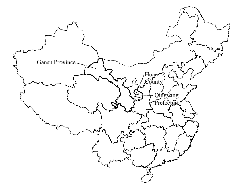
Figure 1. Map of Gansu province, Qingyang prefecture and Huan county

The widespread nature of the forage-ruminant livestock push across the semi-pastoral/agricultural areas[2] of Northern and Western China – from Yili prefecture in the far West of Xinjiang to Chifeng city prefecture in Eastern Inner Mongolia, and with numerous prefectures such as Qingyang in between – warrants a critical review of these developments. The following section overviews previous integrated forage-livestock industry development in Qingyang, while Section 2 sets out the policy framework for the current industry development. Although there is widespread support for promoting integrated forage-livestock systems, translating the intentions into outcomes is compromised by disconnects between government agencies, government and households, and households and the market. The nature of these disconnects and the means of resolving them are discussed in turn in Sections 3-5.