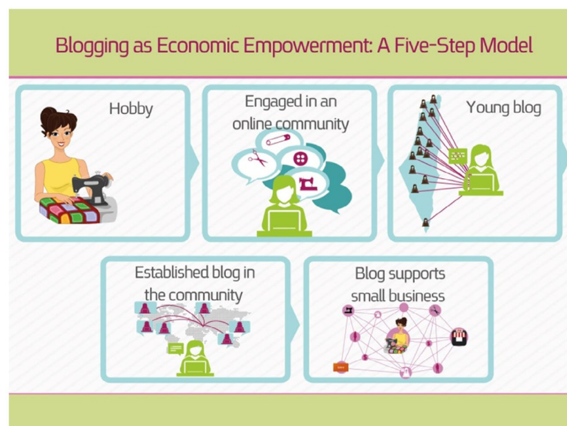
Illustration: Tali Ihie