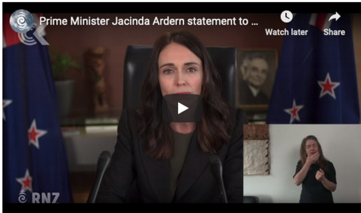
Jacinda Ardern's March 21 explanation of New Zealand's four-level alert system.