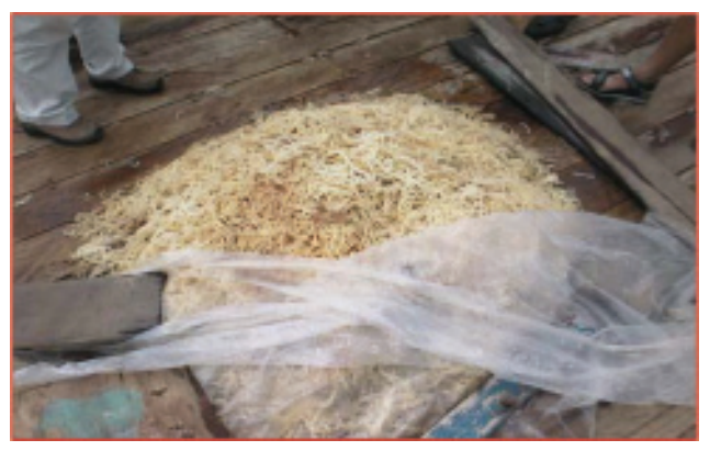
Figure 9: Producing the 'whitish dried seaweed' that could fetch a better price.

local people that eating this seaweed may give a good health due to its micronutrients properties.