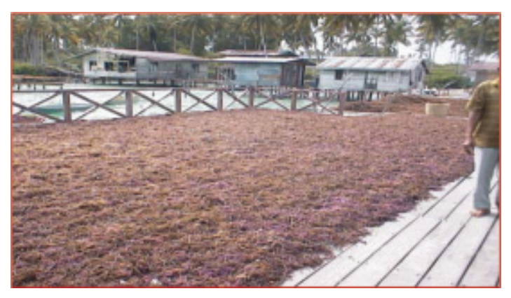
Figure 7: Drying of seaweed on the wooden platform.

There are two types of drying method, which has been practiced widely in Sabah; these are the platform method (Figure 7) and hanging method (Figure 8). The platform method is usually made of three different type of material such as wood, cement or bamboo material is commonly being employed. Basically the drying process will take between 3-5 days and up to 7 days during the dry season and raining season, respectively.