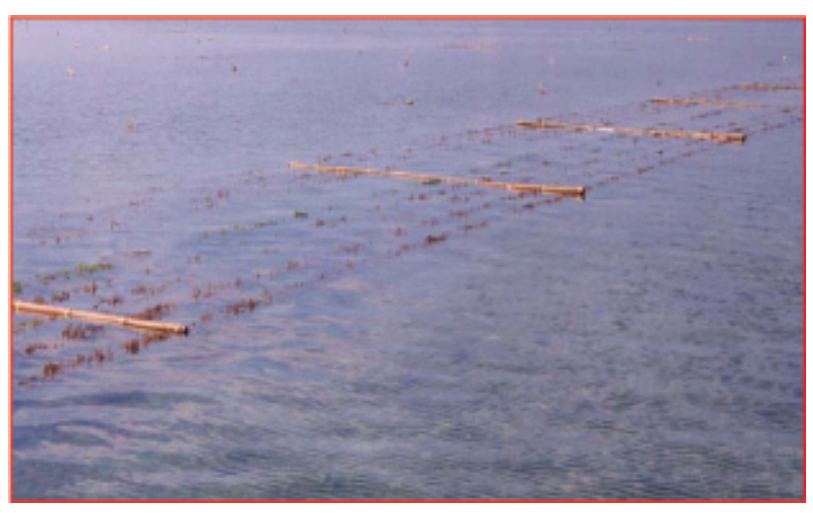
Figure 4: Raft cultivation system mainly being practiced in the deeper water.

In practical, seaweed is ready to be harvested in 1.5 to 2 months period of time (Figure 5). However some areas particularly in certain village in Semporna has shorter period of cultivation (1-1.5 months). The small wooden boat or locally named as 'Bogo-bogo' in Semporna is being used widely not only during planting, but also during maintaining of farm and harvesting (Figure 6). Fiberglass boat equipped with 15HP out boat engine also being employed, particularly in the area where the farm site is located far from they mainland. It is also being used as a mother-boat to transport larger quantity of wet seaweed from the farm to the drying platform.