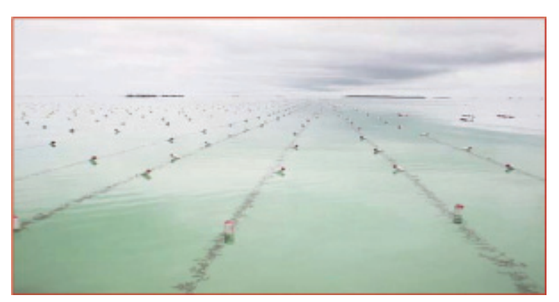
Figure 3: Long lines cultivation system.

Long line system found to be suitable for area with 2m-5m water depth (Figure 3). A total of 6,500 to 9,500 seedlings per acre can be cultured through this system or approximately 21 lines (300 feet per line) per acre. Practically, around 300-450 seedlings per line depending on the size of each seed. The cost of production by employing this system is consider the cheapest system which is around $MR600 per acre. This system was firstly introduced in 1992 in Semporna and it becomes the most popular system and being practiced almost 95 % of seaweed farmer in Sabah. This mainly due to cheaper cost of production and practically easier for installation and maintenance.