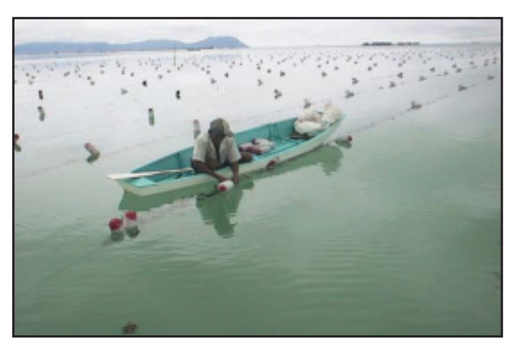
Figure 6: The small wooden type boat locally named as 'Bogo-bogo' in Semporna.