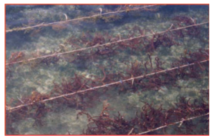
Figure 2: Stake cultivation system widely being practiced in shallow water.

during low tide and 1.5m during high tide (Figure 2). This system can accommodate a total of 14,500 to 15,000 seedlings per acre. Production cost for this system is approximately $MR1,800 per acre and consider as the most expensive system compared to Long Line and Raft Systems. This could be due to the material involved such as hard type wooden stake (e.g mangrove or 'Belian' wood stakes), rope and line, and plastic floater.