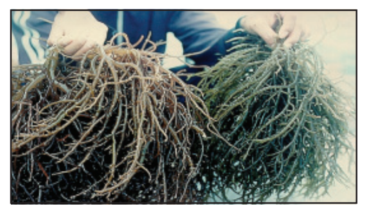
Figure 5: Bunches of seaweed ready to be harvested.