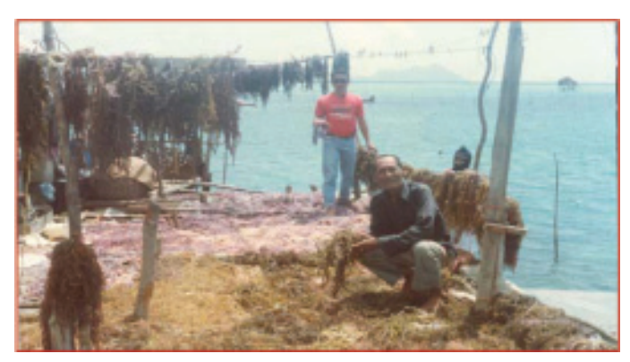
Figure 8: Drying of seaweed by using hanging method.