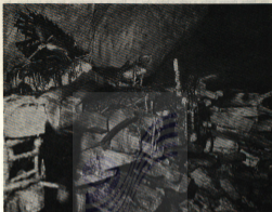
A small part of the coffin assemblage in Batu Baka, including recent ones (with umbrellas on top, see text).